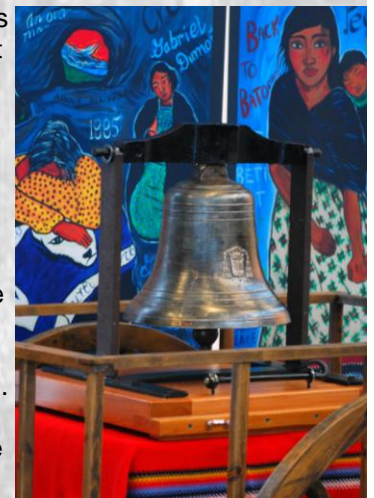
The Bell of Batoche

Even as the Métis celebrate such victories, the fight for their rights continues. In January 2013, the Federal Court ruled that Métis and non-status Indians in Canada are indeed "Indians" under the Constitution Act, and fall under federal jurisdiction. Last month, the Government of Canada asked the Federal Court of Appeal to overturn the historic ruling. And so the struggle goes on. As the Portuguese say, aluta continua. 🌐