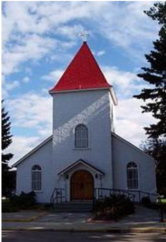
RCMP Chapel, Regina

The annual Louis Riel Day celebrations were held across Saskatchewan on November 16, 2013. In Saskatoon, the celebration was preceded by the opening of the GDI Gallery, Museum and Special Collections on Friday, November 15. The opening was held in two parts to accommodate the over 100 people who helped GDI celebrate this milestone.