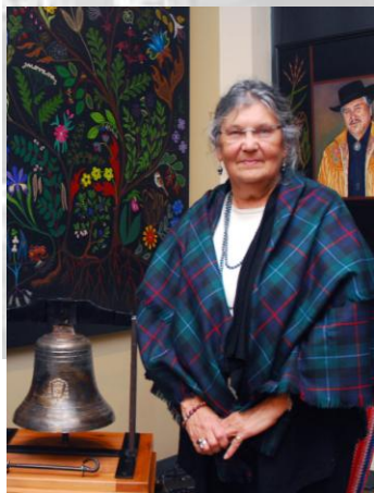
Métis Elder and author Maria Campbell with the Bell of Batoche at the GDI Gallery, Saskatoon